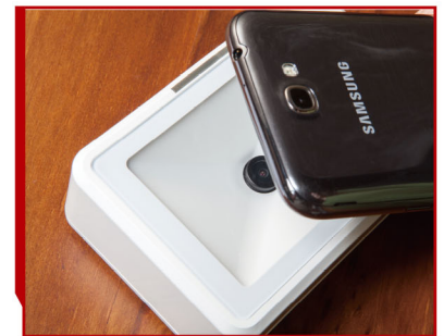
Reading smart phone display codes

It provides wide range of applications: such as retail stores connect to point-of-sale terminals to use mobile coupons, mobile loyalty cards promoting sales. Restaurants can accept mobile coupons at the register. Hotels can use electronic cards stored on guest's smart phones. Theaters, theme parks, stadiums, museums can scan mobile tickets for entrance.