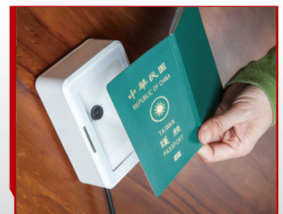
Reading passport OCR codes (Optional)